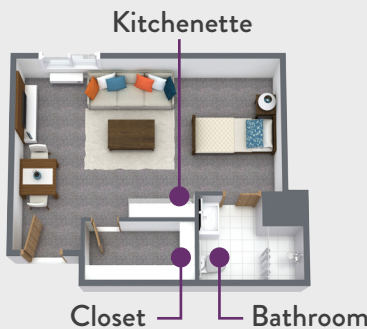
Suite Apartment: $5,100