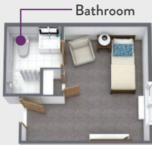
Studio Apartment: $4,500