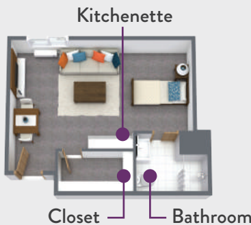
Suite Apartment: $4,800